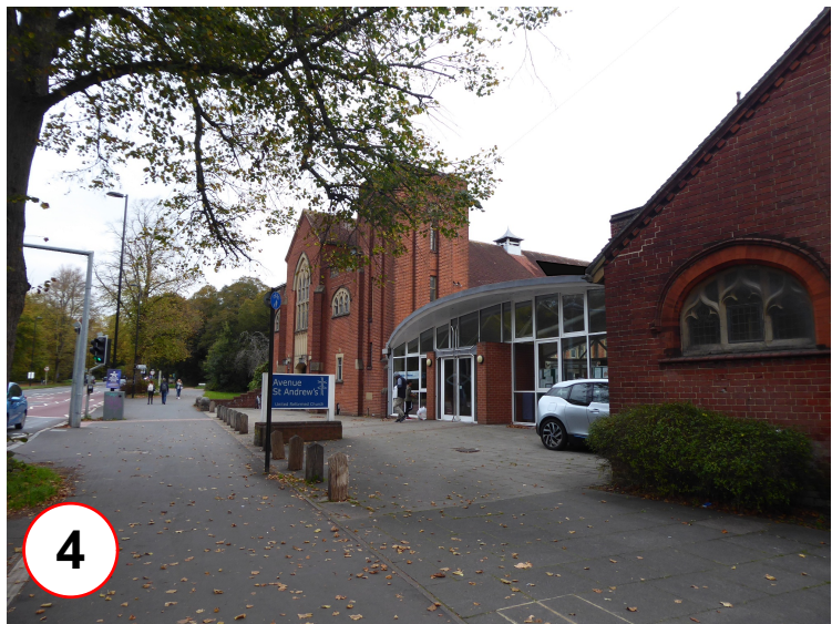
Approximate extent of road/pavement from where the panels may be visible above the concourse link